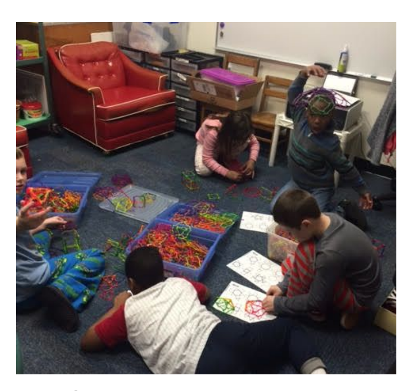
Geometric constructions and visual-spatial thinking