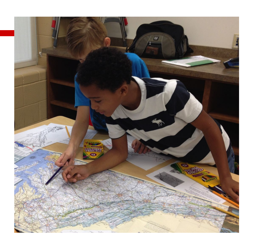
Understanding the Chesapeake Bay