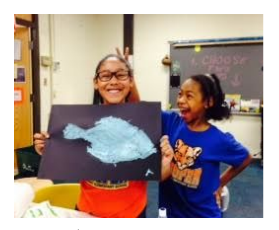
Chesapeake Bay unit